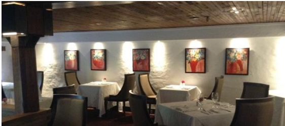
The two end walls can each fit 2 similarly sized pieces.

All of the small pieces fit into the small raised dining area towards the back. There is room for 5 pieces on the back wall and 2 small pieces on each side wall. Due to chairs and tables close by, 20 inches tall is probably the max length. 16-20 wide.